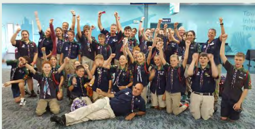
Kennedy Region Scouts departing for AJ2016

PIMLICO MUNDINGBURRA DEN McIntyre Street, Mundingburra